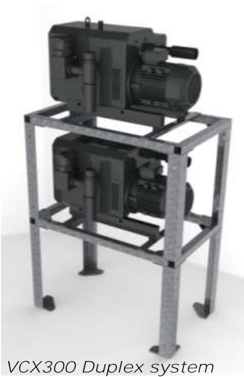
VCX300 Duplex system

Products: Silencers/labyrinth traps, Anticavitation Valves, Vacuum Relief Valves, New equipment.